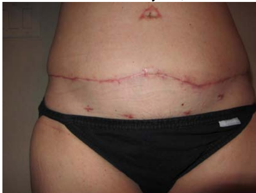
Scar red, slightly raised