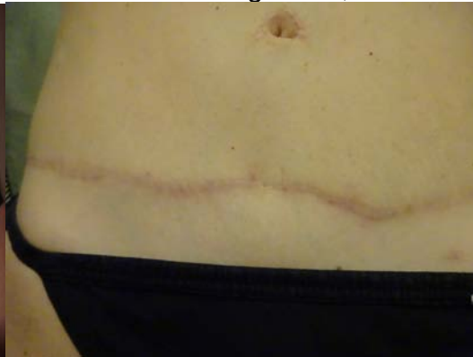
Scar flat, even, very slight color, smooth to the touch

Post 7 months of treatment August 24, 2014